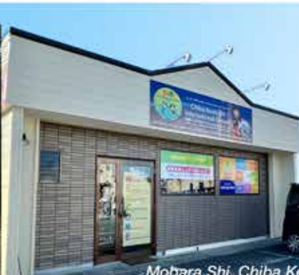
Mobara Shi, Chiba Ken