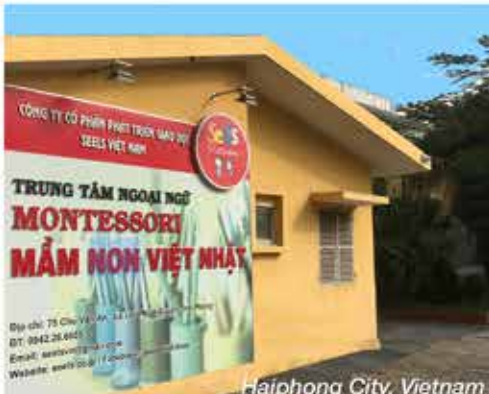
Haiphong City, Vietnam

The Blockchain and AI Platform Development as the backend of Seels DX International School was initiated together with the formation of project Team Members and Advisers Formation starting from the middle part of 2022. (Management Team Members on the next page).